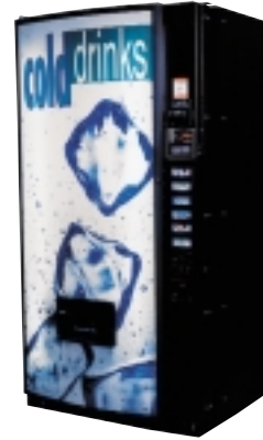
RVCDE 480 Standard Cabinet