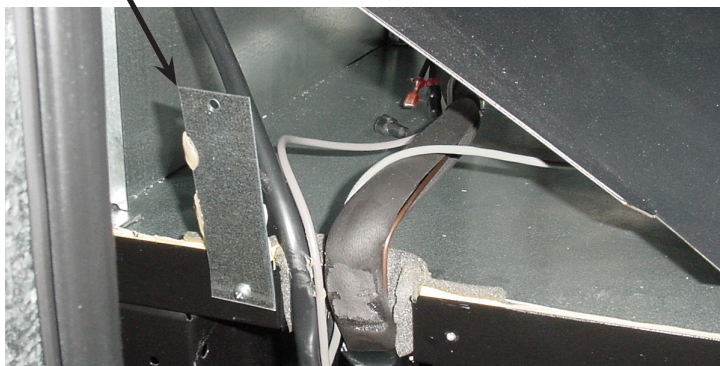
Wiring cover plate

Loosen the screws that secure the wiring cover plate, and turn it upward.